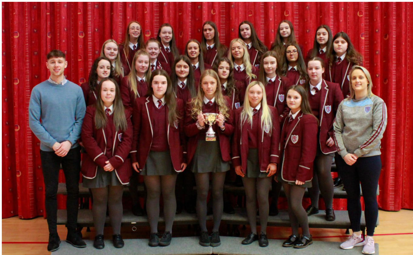
U16 Ulster Ladies Schools Foyle Cup Winners 2021-2022