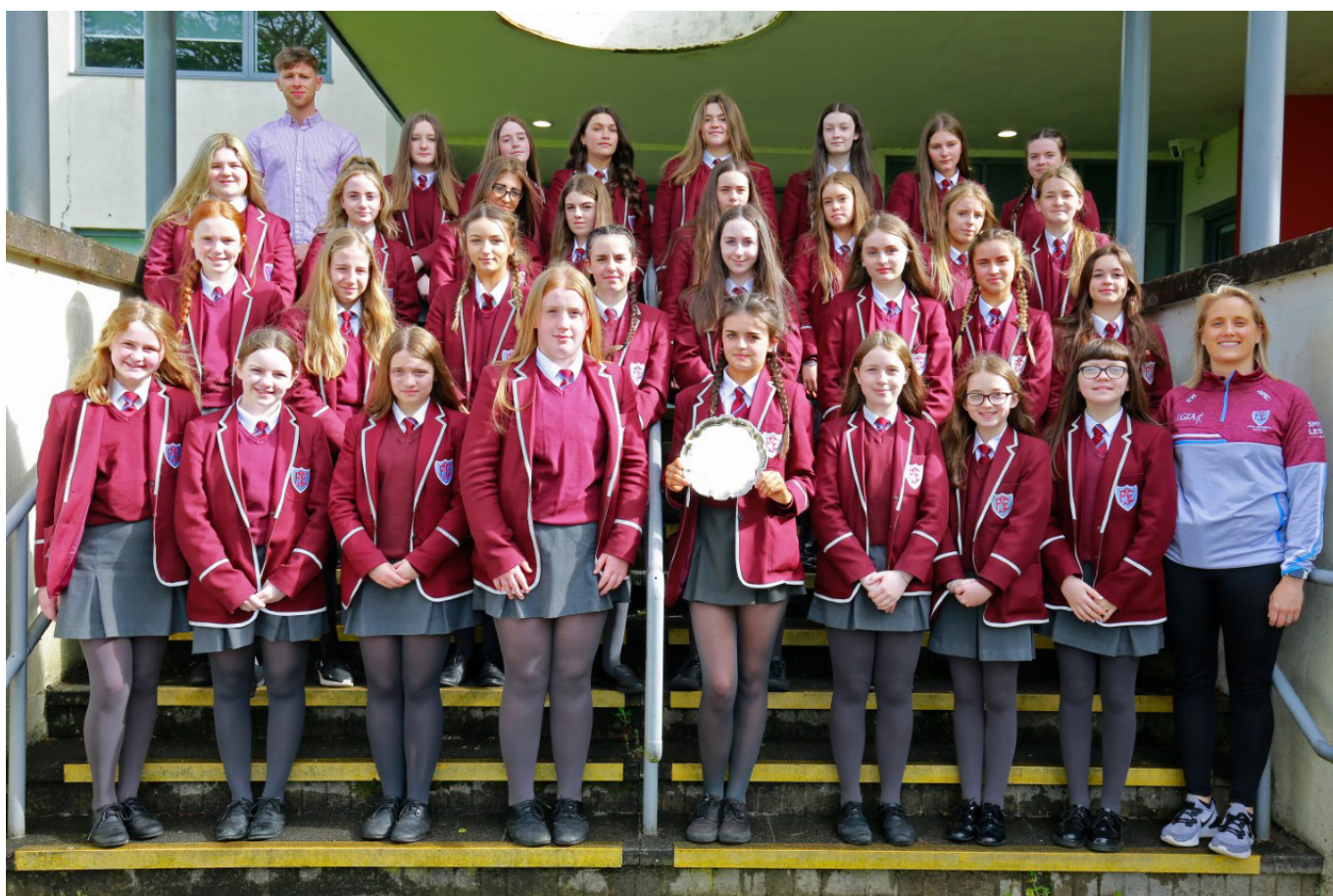
U14 Ulster Ladies Schools U14D Plate Winners 2021-2022