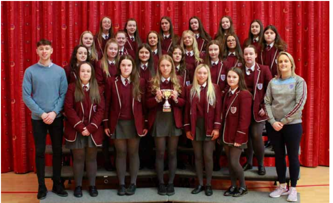
U16 Ulster Ladies Schools Foyle Cup Winners 2021-2022