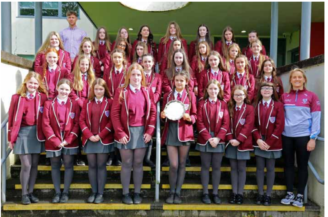
U14 Ulster Ladies Schools U14D Plate Winners 2021-2022